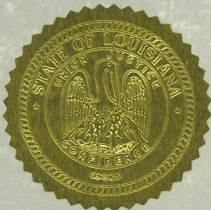
John Bel Edwards Governor

IN WITNESS WHEREOF, I have hereunto set my hand officially and caused to be affixed the Great Seal of the State of Louisiana, at the Capitol, in the City of Baton Rouge, on this 1st day of May A. D., 2023 .